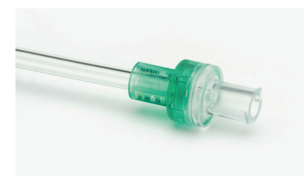
Anti-reflux valve to prevent back flow