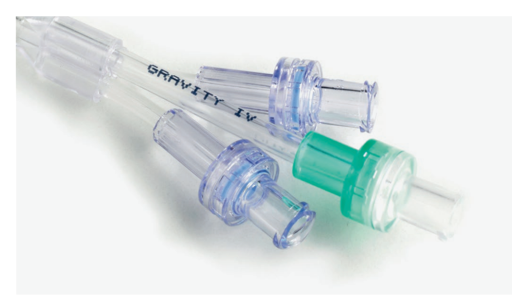
Wide bore gravity line to allow high flow of IV fluid