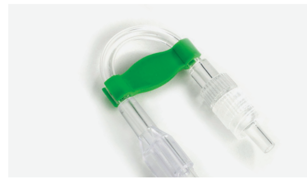
J-loop to prevent kinking/occlusion of the tubing